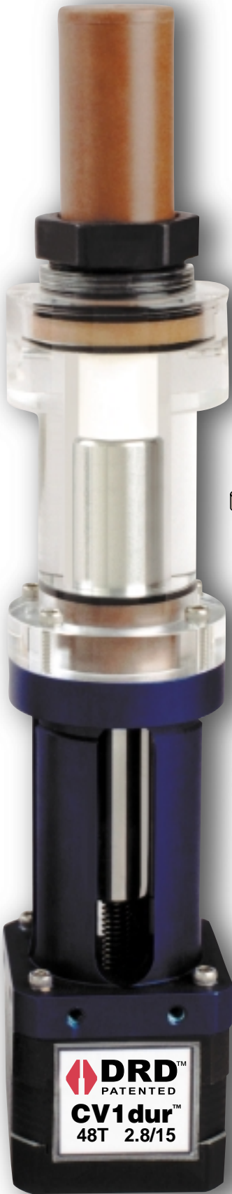
MODEL 48T ACTUAL SIZE 8.9" (22.6 cm) high