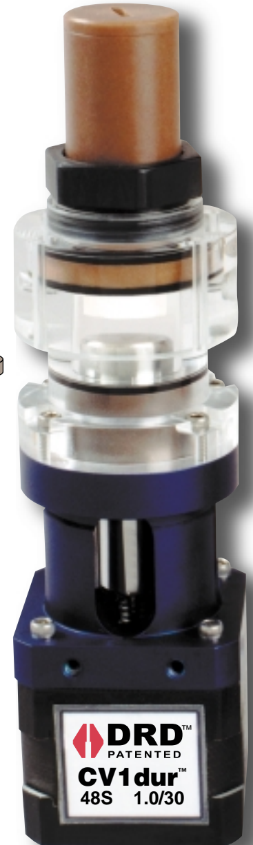
MODEL 48S ACTUAL SIZE 6.1" (15.5 cm) high